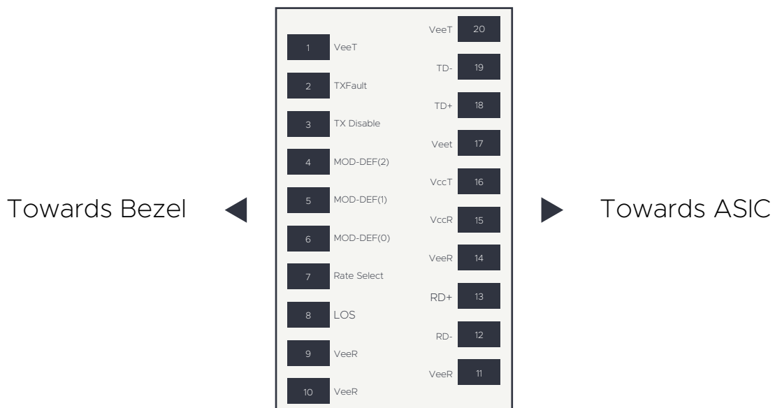
Figure 1. Diagram of host board connector block pin numbers and names