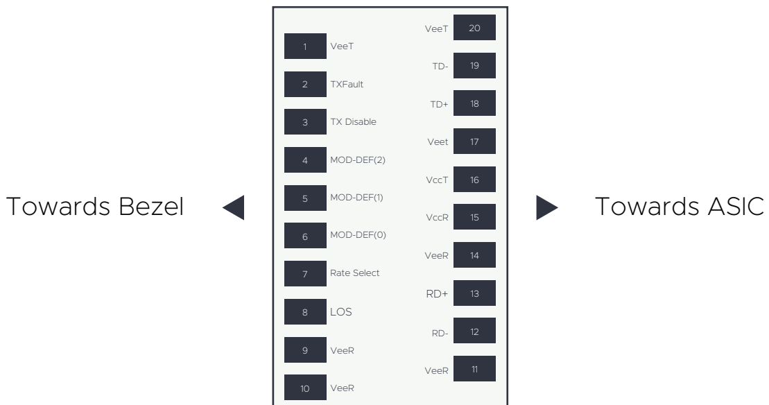
Figure 1. Diagram of host board connector block pin numbers and names