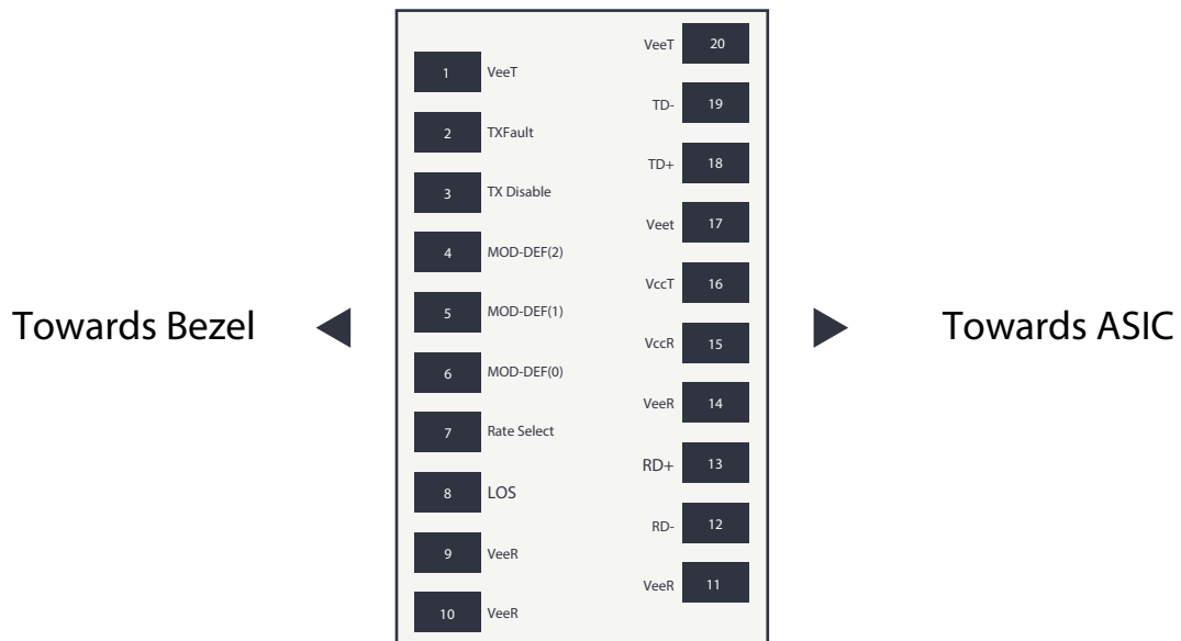
Figure 1. Diagram of host board connector block pin numbers and names