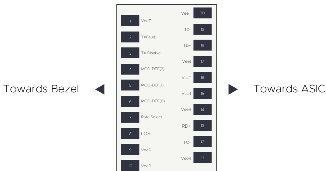
Figure 1: Diagram of host board connector block pin numbers and names